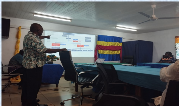
DCU conducting consultation with PTAC and all line departments

The Decentralization Unit (DCU) exists to advise the recommendations of the Decentralization Review Committee (DRC) and to advise the Minister of Internal Affairs on Decentralization policy and development and strengthen for delivering government services to the provinces