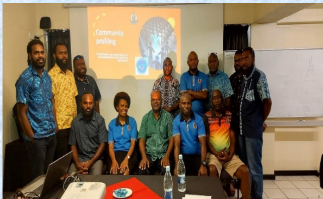
Community Profiling training workshop with Malampa Area Administrators conducted by DPU.

The Development Planning Unit (DPU) exists to provide Community Development Planning advice and support for the socio-economic development of the rural area of Vanuatu.