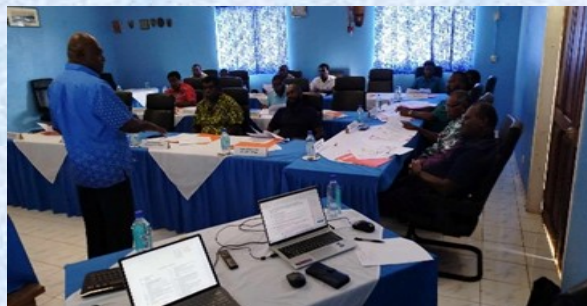
Induction of Sanma Provincial Councillors led by HQ DLA team